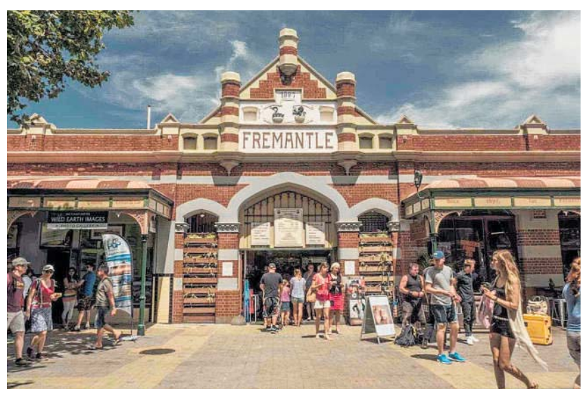
The bustling Fremantle Markets have been trading since the 19th Century; my amazing tour guide Michael Deller; the La Sosta Italian restaurant; popular diner Bathers Beach House; the High Street is packed with heritage buildings.