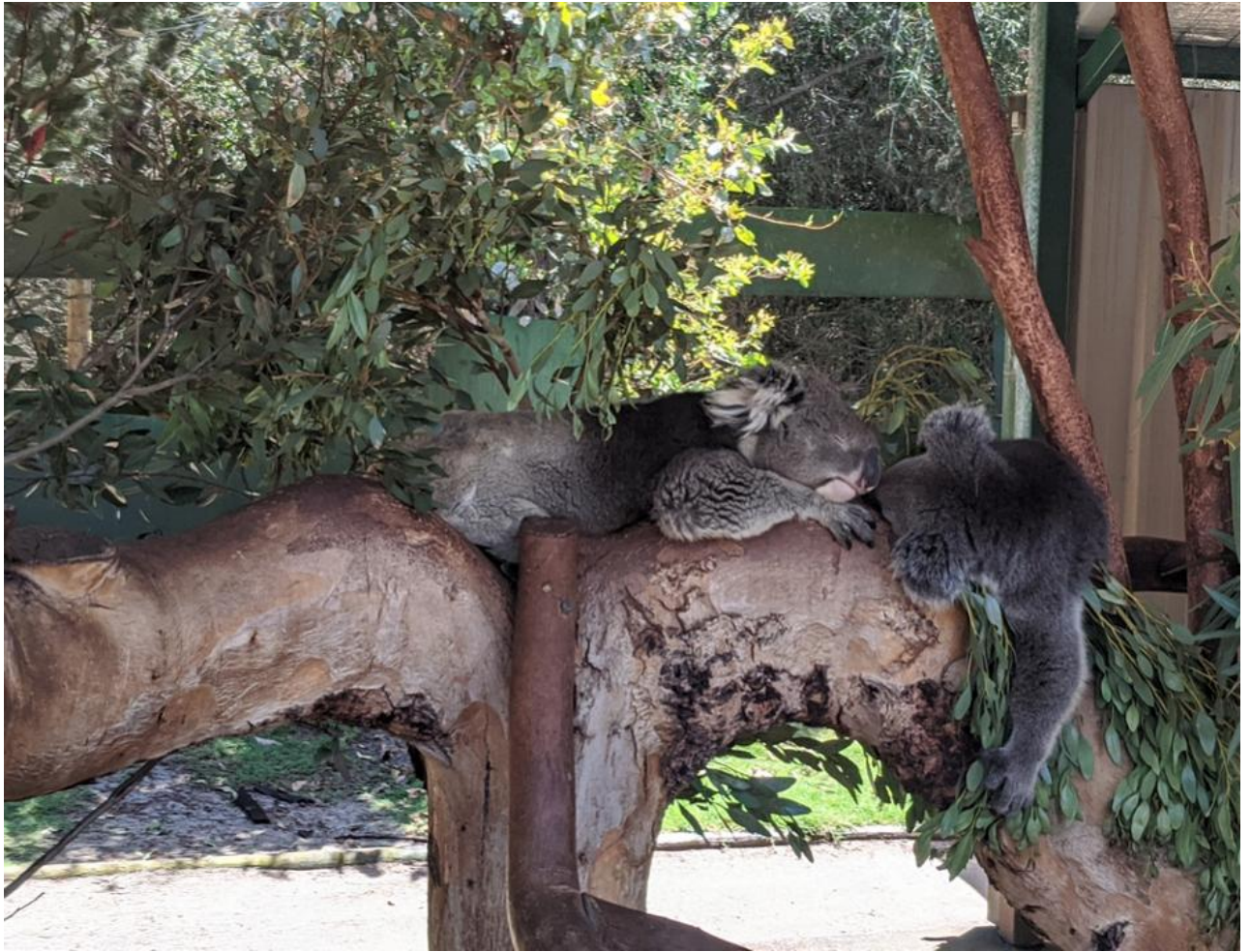
Caversham Wildlife Park SANDRA MACGREGOR