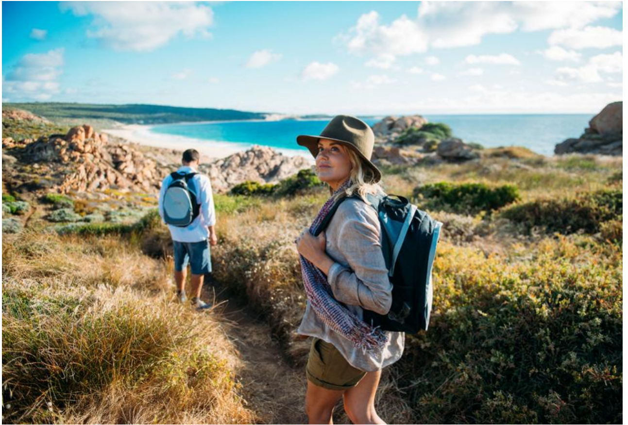
Cape to Cape Track, Margaret River Region WA TOURISM