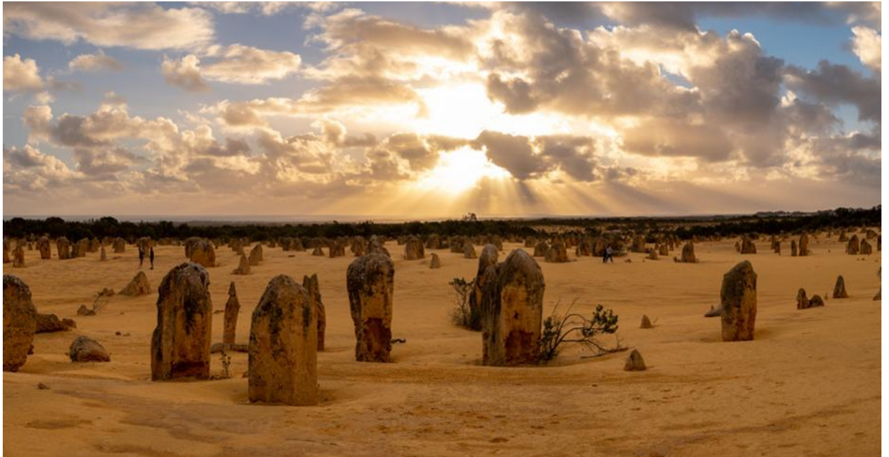
The Pinnacles at Nambung National Park