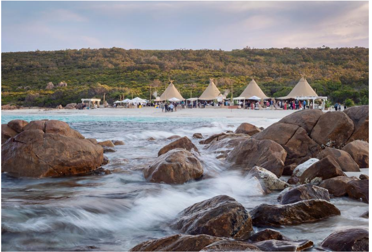
Western Australia Gourmet Escape Beach BBQ GARRY NORRIS