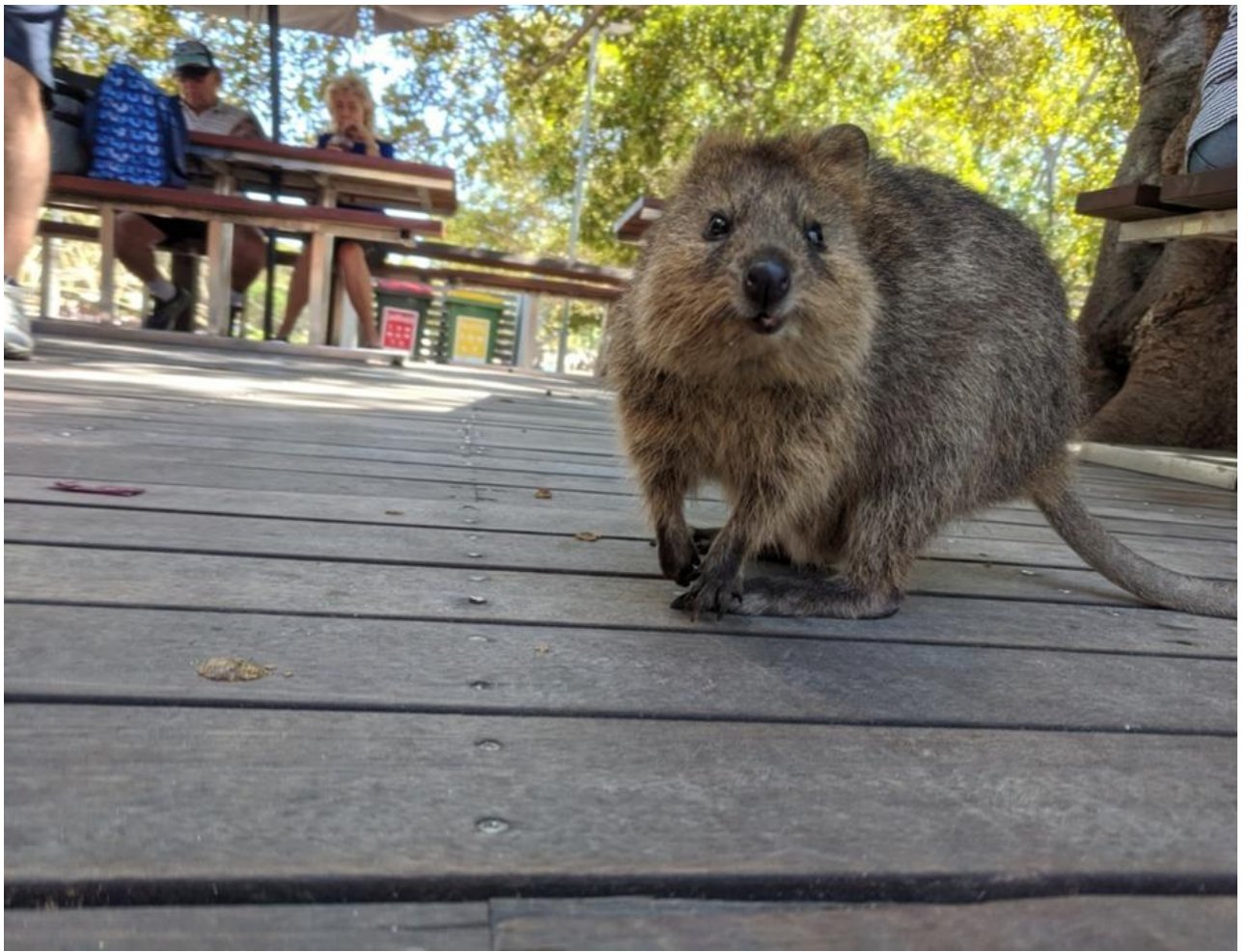
Quokka on Rottnest Island SANDRA MACGREGOR