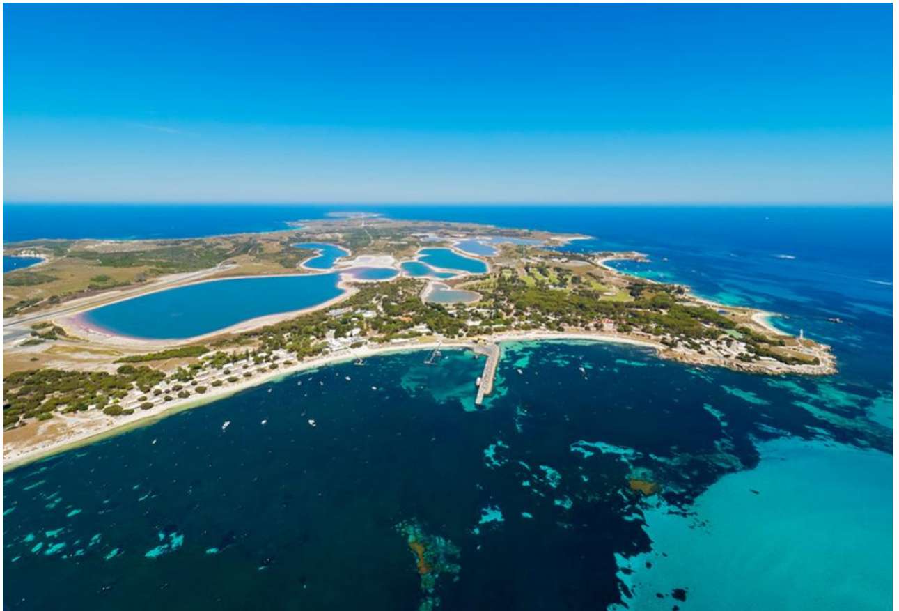
Aerial view of Rottnest Island

While Australia's awe-inspiring east coast—home to Sydney, Melbourne and the Great Barrier Reef—gets the lion's share of attention, intrepid adventurers would be wise to go west and explore the country's under-appreciated Western region. Western Australia comprises a third of the country and hosts some of the nation's most phenomenal beaches, national parks, animal experiences, as well as the dynamic and engaging urban center, Perth, Australia's sunniest capital. Though you could spend a lifetime in the vast region and never discover all of its wonders, here's a taste of some of the best things to do in Western Australia.