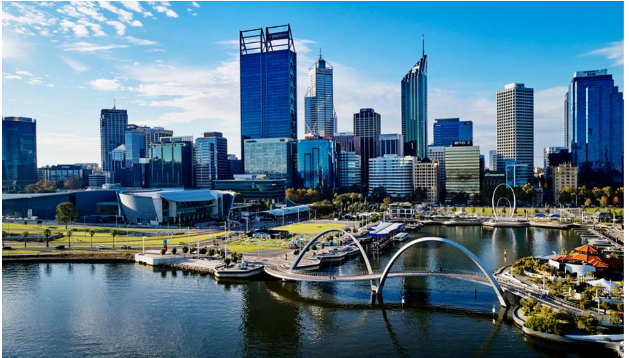
Elizabeth Quay