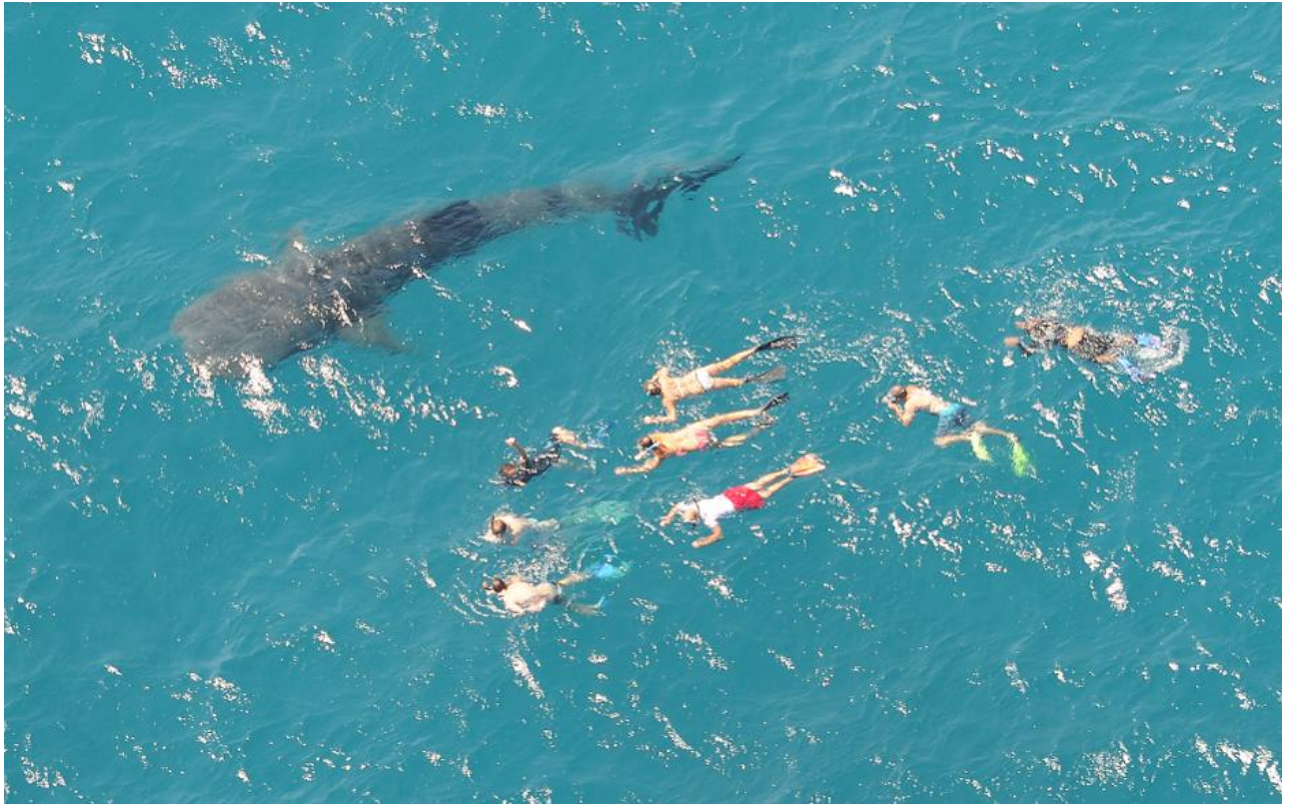
Whale Sharks in Ningaloo Reef, Western Australia.